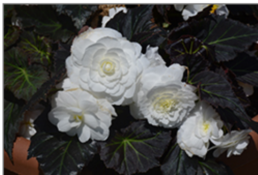
Nonstop Mocca White Begonia flowers

Nonstop Mocca White Begonia is recommended for the following landscape applications;