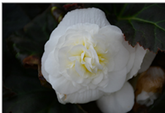
Nonstop Mocca White Begonia flowers