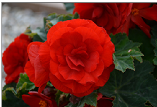
Nonstop Deep Red Begonia flowers

Nonstop Deep Red Begonia is recommended for the following landscape applications;