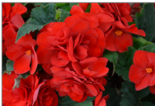
Nonstop Deep Red Begonia flowers