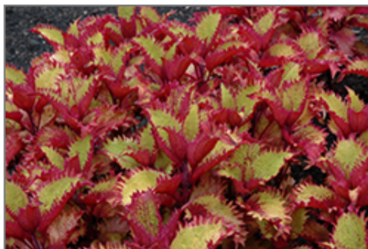
Henna Coleus foliage