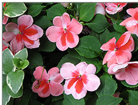
Patchwork Pink Shades Impatiens flowers

Patchwork Pink Shades Impatiens is recommended for the following landscape applications;