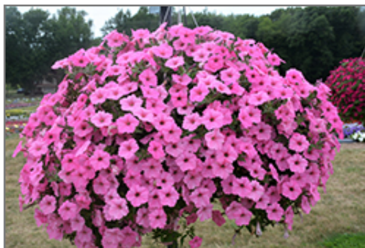
Supertunia Vista Bubblegum Petunia in bloom

Supertunia Vista Bubblegum Petunia is a fine choice for the garden, but it is also a good selection for planting in outdoor containers and hanging baskets. Because of its trailing habit of growth, it is ideally suited for use as a 'spiller' in the 'spiller-thriller-filler' container combination; plant it near the edges where it can spill gracefully over the pot. Note that when growing plants in outdoor containers and baskets, they may require more frequent waterings than they would in the yard or garden.