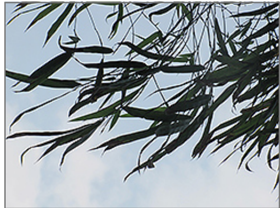
Chinese Goddess Bamboo foliage