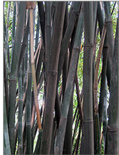
Chinese Goddess Bamboo bark

Chinese Goddess Bamboo is recommended for the following landscape applications;