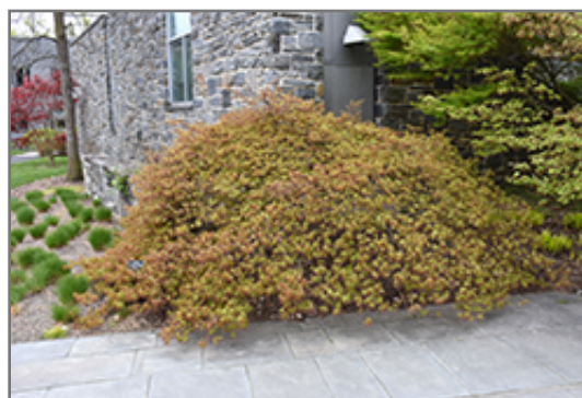
Spring Delight Japanese Maple