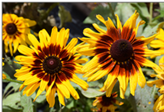
Denver Daisy Coneflower flowers