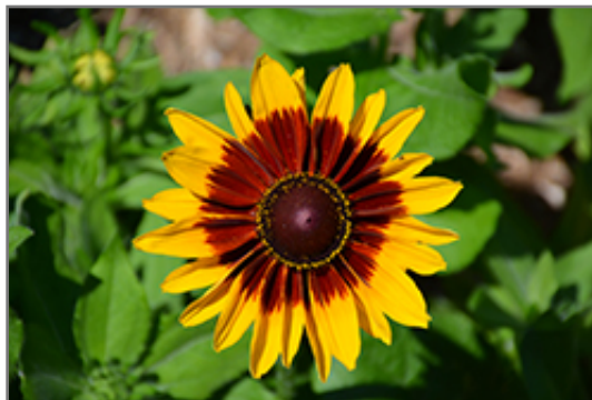
Denver Daisy Coneflower flowers

Denver Daisy Coneflower is an herbaceous perennial with an upright spreading habit of growth. Its medium texture blends into the garden, but can always be balanced by a couple of finer or coarser plants for an effective composition.