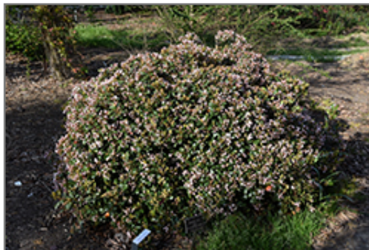
Eleanor Taber Indian Hawthorn in bloom

Eleanor Taber Indian Hawthorn is recommended for the following landscape applications;