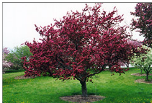
Profusion Flowering Crab in bloom