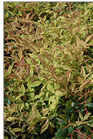
Gulf Stream Dwarf Nandina foliage