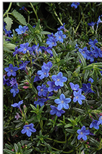
Grace Ward Lithodora flowers