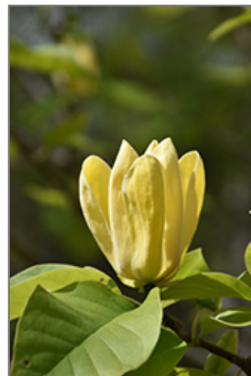
Yellow Bird Magnolia flowers