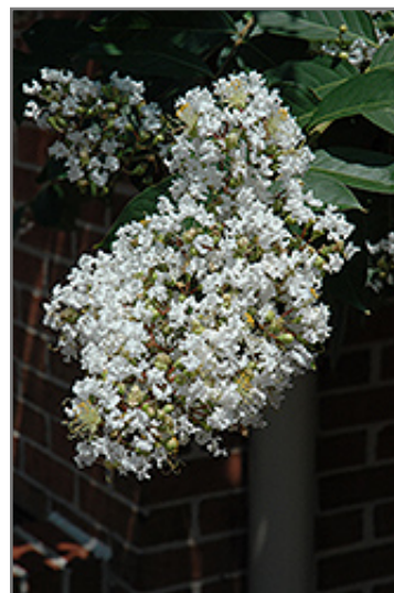
Natchez Crapemyrtle flowers

This is a relatively low maintenance tree, and is best pruned in late winter once the threat of extreme cold has passed. Deer don't particularly care for this plant and will usually leave it alone in favor of tastier treats. It has no significant negative characteristics.