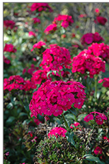
Amazon Neon Cherry Pinks flowers

This is a relatively low maintenance plant, and is best cleaned up in early spring before it resumes active growth for the season. It is a good choice for attracting bees and butterflies to your yard, but is not particularly attractive to deer who tend to leave it alone in favor of tastier treats. It has no significant negative characteristics.