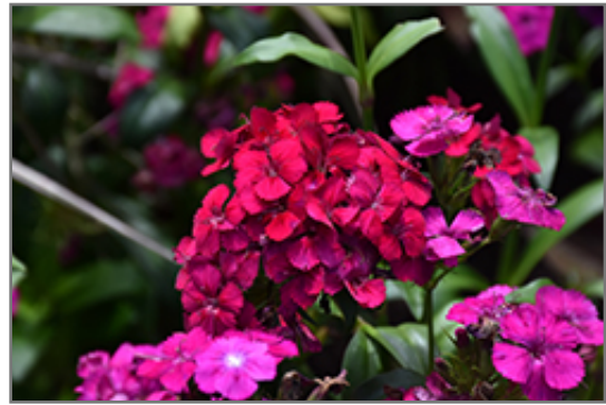
Amazon Neon Cherry Pinks flowers

Amazon Neon Cherry Pinks will grow to be about 30 inches tall at maturity, with a spread of 15 inches. When grown in masses or used as a bedding plant, individual plants should be spaced approximately 12 inches apart. Its foliage tends to remain dense right to the ground, not requiring facer plants in front. It grows at a medium rate, and under ideal conditions can be expected to live for approximately 10 years. As an evergreen perennial, this plant will typically keep its form and foliage year-round.