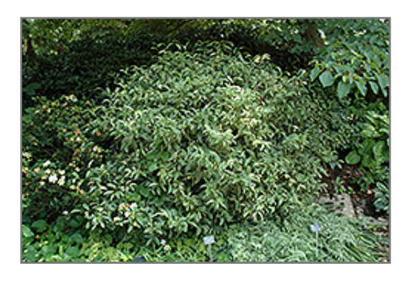
Variegated Cleyera

2974 Johnston St., Lafayette, LA 70503 (337) 264-1418 buyallseasons.com