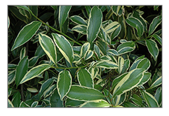
Variegated Cleyera foliage