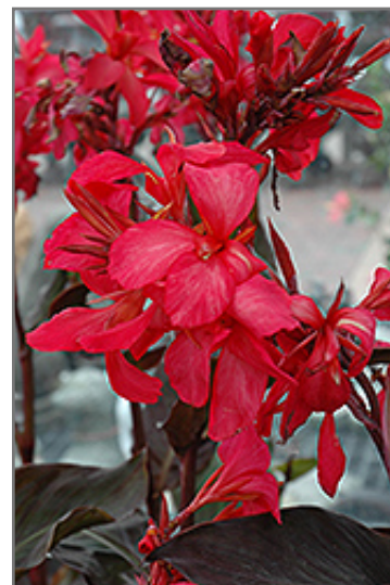
Bronze Water Canna flowers