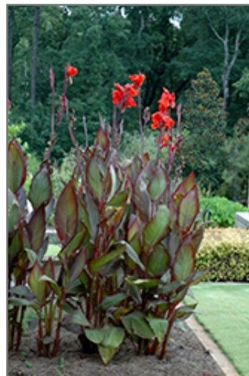
Bronze Water Canna in bloom