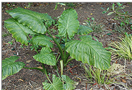
Elephant's Ear