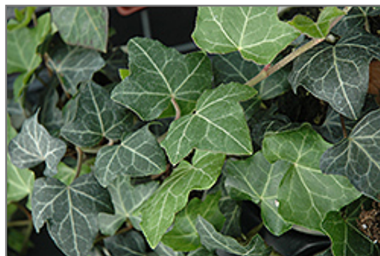
Baltic Ivy foliage