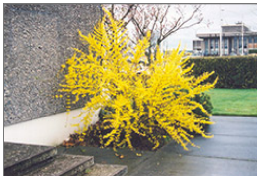
Showy Border Forsythia in bloom