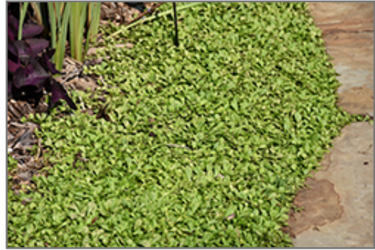
Creeping Mazus

Creeping Mazus will grow to be only 2 inches tall at maturity extending to 3 inches tall with the flowers, with a spread of 12 inches. Its foliage tends to remain low and dense right to the ground. It grows at a fast rate, and under ideal conditions can be expected to live for approximately 10 years. As an evergreen perennial, this plant will typically keep its form and foliage year-round.