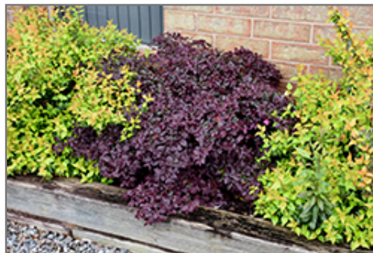
Purple Pixie Fringeflower