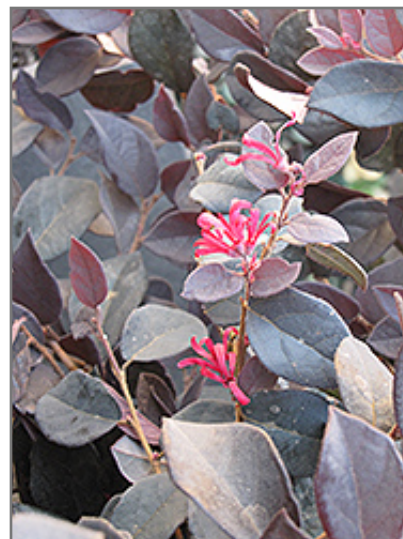
Purple Pixie Fringeflower flowers