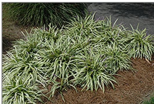
Variegata Lily Turf in bloom