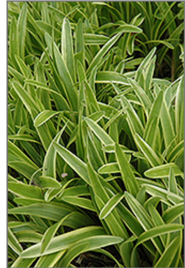
Variegata Lily Turf foliage

This plant does best in partial shade to full shade. Keep it well away from hot, dry locations that receive direct afternoon sun or which get reflected sunlight, such as against the south side of a white wall. It does best in average to evenly moist conditions, but will not tolerate standing water. It may require supplemental watering during periods of drought or extended heat. It is not particular as to soil type or pH. It is somewhat tolerant of urban pollution. This is a selected variety of a species not originally from North America. It can be propagated by division; however, as a cultivated variety, be aware that it may be subject to certain restrictions or prohibitions on propagation.