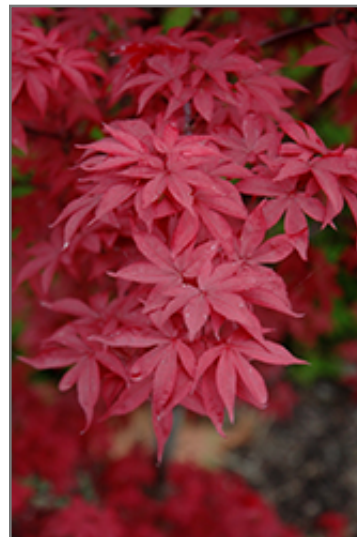
Twombly's Red Sentinel Japanese Maple foliage