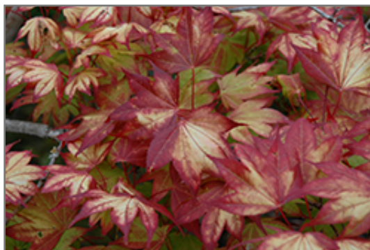
Tsuma Gaki Japanese Maple foliage

Tsuma Gaki Japanese Maple will grow to be about 10 feet tall at maturity, with a spread of 10 feet. It tends to be a little leggy, with a typical clearance of 2 feet from the ground, and is suitable for planting under power lines. It grows at a slow rate, and under ideal conditions can be expected to live for 60 years or more.