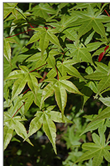
Shindeshojo Japanese Maple foliage

Shindeshojo Japanese Maple is recommended for the following landscape applications;