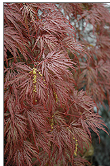
Inaba Shidare Cutleaf Japanese Maple foliage

Inaba Shidare Cutleaf Japanese Maple is recommended for the following landscape applications;