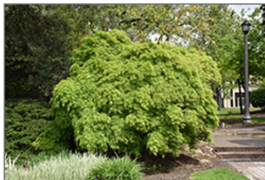
Cutleaf Japanese Maple "Viridis"