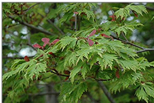
Maiku Jaku Fernleaf Full Moon Maple foliage