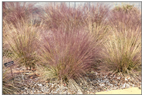
Hairawn Muhly in fall