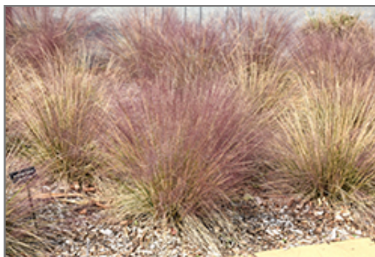
Hairawn Muhly in fall