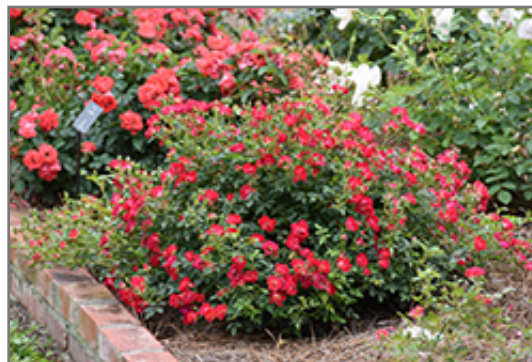
Red Drift Rose in bloom