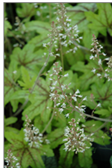
Alabama Sunrise Foamy Bells flowers