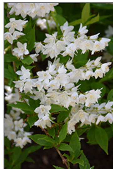
Chardonnay Pearls Deutzia flowers