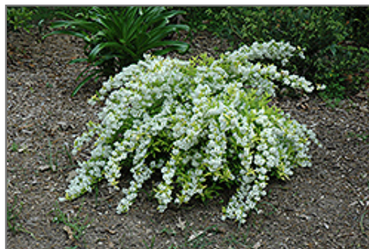
Chardonnay Pearls Deutzia in bloom

Chardonnay Pearls Deutzia is recommended for the following landscape applications;