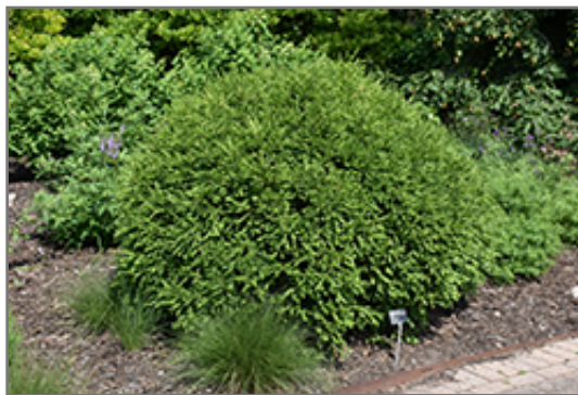
Green Gem Boxwood