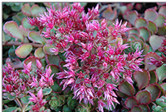
Fulda Glow Stonecrop flowers