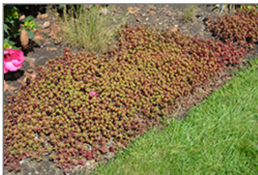
Fulda Glow Stonecrop