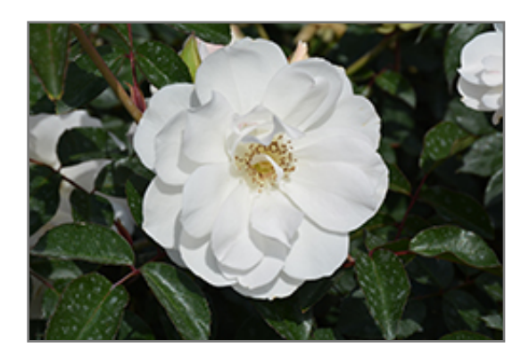
Iceberg Rose flowers

2974 Johnston St., Lafayette, LA 70503 (337) 264-1418 buyallseasons.com