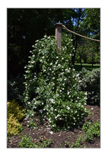
Iceberg Rose in bloom