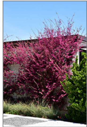
Red-Flowered Chinese Fringeflower in bloom

This shrub does best in full sun to partial shade. It prefers to grow in average to moist conditions, and shouldn't be allowed to dry out. It may require supplemental watering during periods of drought or extended heat. It is particular about its soil conditions, with a strong preference for rich, acidic soils. It is somewhat tolerant of urban pollution. Consider applying a thick mulch around the root zone in winter to protect it in exposed locations or colder microclimates. This is a selected variety of a species not originally from North America.