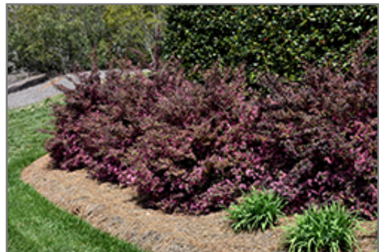
Red-Flowered Chinese Fringeflower in bloom