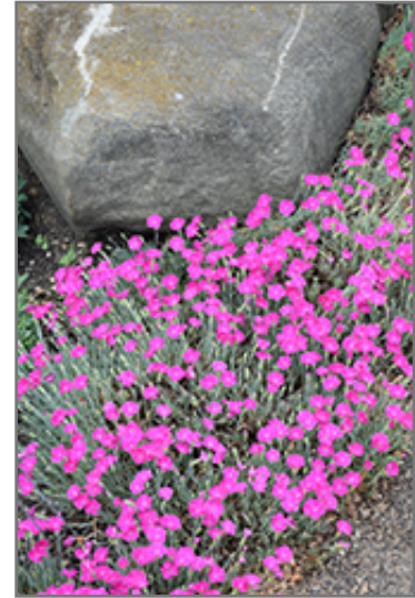
Firewitch Pinks in bloom

Firewitch Pinks is a fine choice for the garden, but it is also a good selection for planting in outdoor pots and containers. It is often used as a 'filler' in the 'spiller-thriller-filler' container combination, providing a mass of flowers and foliage against which the thriller plants stand out. Note that when growing plants in outdoor containers and baskets, they may require more frequent waterings than they would in the yard or garden.