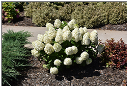
Little Lime Punch Hydrangea in bloom

This shrub performs well in both full sun and full shade. It prefers to grow in average to moist conditions, and shouldn't be allowed to dry out. It may require supplemental watering during periods of drought or extended heat. To help this plant achieve its best flowering performance, periodically apply a flower-boosting fertilizer from early spring through into the active growing season. It is not particular as to soil type or pH. It is highly tolerant of urban pollution and will even thrive in inner city environments. Consider applying a thick mulch around the root zone in both summer and winter to conserve soil moisture and protect it in exposed locations or colder microclimates. This is a selected variety of a species not originally from North America.