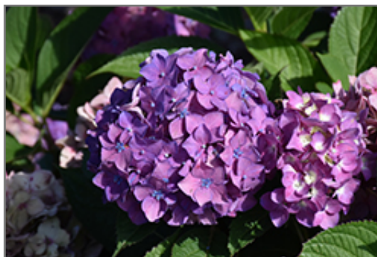
Let's Dance Arriba! Hydrangea flowers

Let's Dance Arriba! Hydrangea is recommended for the following landscape applications;