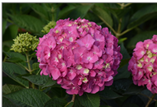
Let's Dance Arriba! Hydrangea flowers