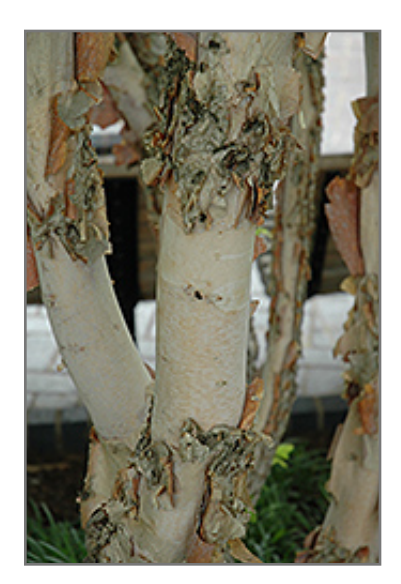
Fox Valley River Birch bark

2974 Johnston St., Lafayette, LA 70503 (337) 264-1418 buyallseasons.com