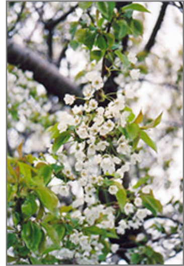
Sweet Cherry flowers

Sweet Cherry is covered in stunning clusters of fragrant white flowers hanging below the branches in early spring before the leaves. It has dark green deciduous foliage. The pointy leaves turn yellow in fall. The fruits are showy red drupes carried in abundance in mid summer. The fruit can be messy if allowed to drop on the lawn or walkways, and may require occasional clean-up. The smooth dark red bark adds an interesting dimension to the landscape.