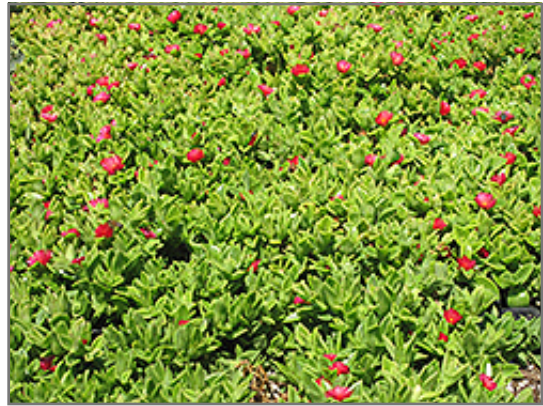
Red Apple Baby Sun Rose

Red Apple Baby Sun Rose will grow to be only 4 inches tall at maturity, with a spread of 3 feet. Its foliage tends to remain low and dense right to the ground. It grows at a fast rate, and under ideal conditions can be expected to live for approximately 3 years. As an evergreen perennial, this plant will typically keep its form and foliage year-round.