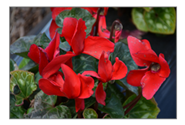
Mammoth Red Cyclamen flowers

2974 Johnston St., Lafayette, LA 70503 (337) 264-1418 buyallseasons.com