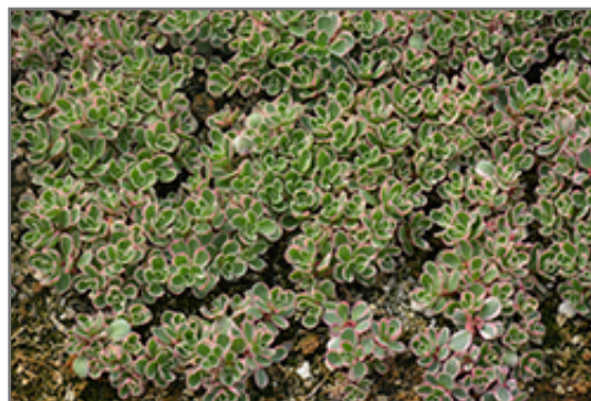
Tricolor Stonecrop flowers

Tricolor Stonecrop will grow to be only 4 inches tall at maturity, with a spread of 18 inches. When grown in masses or used as a bedding plant, individual plants should be spaced approximately 15 inches apart. Its foliage tends to remain low and dense right to the ground. It grows at a fast rate, and under ideal conditions can be expected to live for approximately 10 years. As an herbaceous perennial, this plant will usually die back to the crown each winter, and will regrow from the base each spring. Be careful not to disturb the crown in late winter when it may not be readily seen!