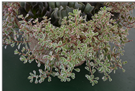
Tricolor Stonecrop