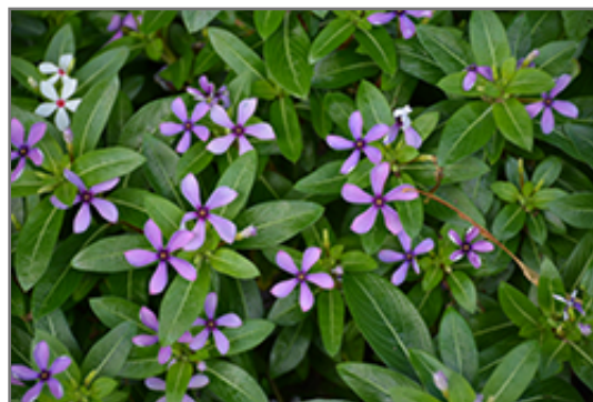
Soiree Kawaii Blueberry Kiss Vinca flowers