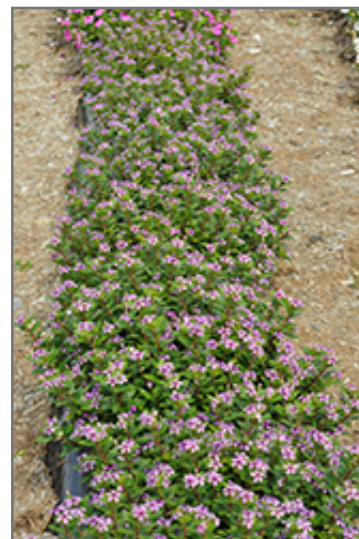
Soiree Kawaii Blueberry Kiss Vinca in bloom

Soiree Kawaii Blueberry Kiss Vinca is a fine choice for the garden, but it is also a good selection for planting in outdoor containers and hanging baskets. Because of its trailing habit of growth, it is ideally suited for use as a 'spiller' in the 'spiller-thriller-filler' container combination; plant it near the edges where it can spill gracefully over the pot. Note that when growing plants in outdoor containers and baskets, they may require more frequent waterings than they would in the yard or garden.