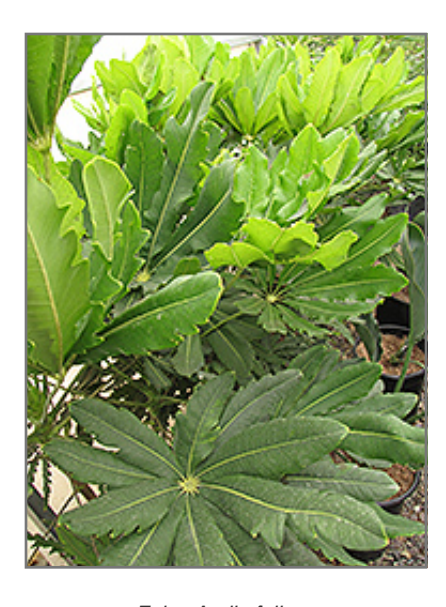
False Aralia foliage

When grown indoors, False Aralia can be expected to grow to be about 5 feet tall at maturity, with a spread of 24 inches. It grows at a medium rate, and under ideal conditions can be expected to live for approximately 10 years. This houseplant will do well in a location that gets either direct or indirect sunlight, although it will usually require a more brightly-lit environment than what artificial indoor lighting alone can provide. It prefers to grow in average to moist soil. The surface of the soil shouldn't be allowed to dry out completely, and so you should expect to water this plant once and possibly even twice each week. Be aware that your particular watering schedule may vary depending on its location in the room, the pot size, plant size and other conditions; if in doubt, ask one of our experts in the store for advice. It is not particular as to soil type or pH; an average potting soil should work just fine. Be warned that parts of this plant are known to be toxic to humans and animals, so special care should be exercised if growing it around children and pets.