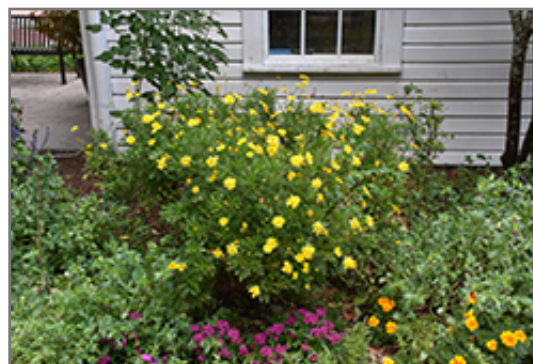
African Bush Daisy flowers