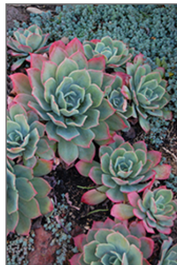
Blue Mist Echeveria

Blue Mist Echeveria is recommended for the following landscape applications;