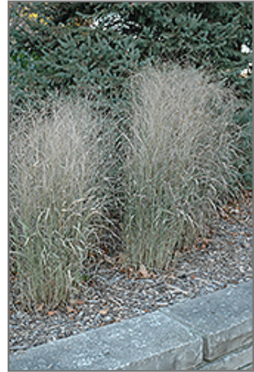
Shenandoah Reed Switch Grass in fall

This plant does best in full sun to partial shade. It is very adaptable to both dry and moist locations, and should do just fine under typical garden conditions. It is considered to be drought-tolerant, and thus makes an ideal choice for a low-water garden or xeriscape application. It is not particular as to soil type, but has a definite preference for alkaline soils, and is able to handle environmental salt. It is somewhat tolerant of urban pollution. This is a selection of a native North American species. It can be propagated by division; however, as a cultivated variety, be aware that it may be subject to certain restrictions or prohibitions on propagation.