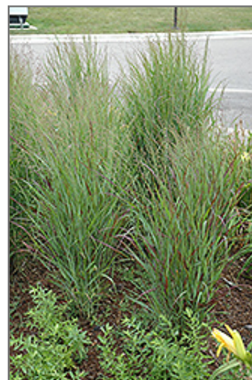
Shenandoah Reed Switch Grass