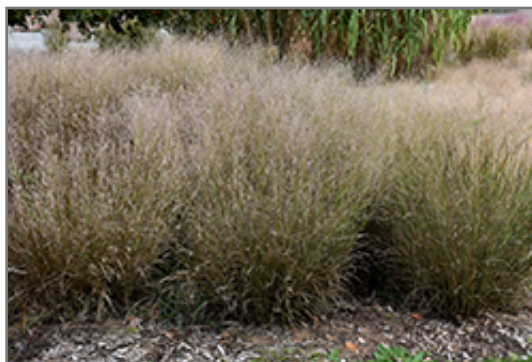
Shenandoah Reed Switch Grass fruit